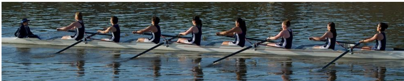
Varsity 8+ Racing at the Wine Country Classic

With a solid fall of training behind us, it is fun to start looking forward to spring and 2000m racing! The team is deeper than we had anticipated and it looks like we can be very competitive in at least two eights for racing. At the beginning of spring that will be a Varsity and Novice 8+; at the end of spring the Varsity and JV 8+'s will be prioritized. If the athletes come back in good shape and we have some successful fundraising efforts, we will take the two priority boats on the long trips to San Diego and Vancouver, WA (Just across the river from Portland, OR).