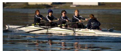
Novice 4+ practicing at Briones

At the end of racing, everyone was very excited for what is to come in the spring and felt their efforts had paid off with great performances on race day. As you can see from the results, every second will count this spring!